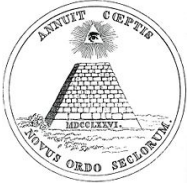
US Seal adopted 1782

There is a war that has been raging since antiquity a war for our hearts and our minds, for our flesh, for our very souls; to bring all mankind under a one world order (novus ordo seclorum) 31 as George Washington put it, “orchestrated by a small group of cunning, ambitious, and unprincipled men 32 who have subverted the power of the people and usurped for themselves the reins of government. They have put in the place of the delegated will of the nation the will of a small but artful and enterprising minority to make the public administration the mirror of their ill-concerted and incongruous projects of faction, rather than the organ of consistent and wholesome plans digested by common counsels and modified by mutual interests.”